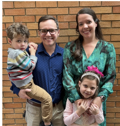
The Sims Family Tyler, Lillian, Valerie & Langdon